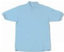
Basic Uniforms Tops Polo-Light Blue