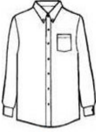
Boys/Mens Oxford Cloth Style#520