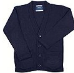
Boy's Knit V-Neck Cardigan