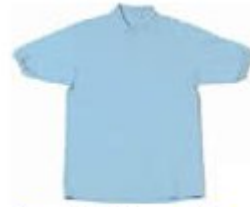
Basic Uniforms Tops Polo-Light Blue